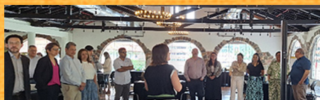
PSG workshop on Human Rights, Gender Equality, and Leaving No One Behind in Panama

A virtual workshop on Environmental Sustainability and Disaster Risk Management was held on 11 October with Cuba's Resident Coordinator's Office (RCO), as Cuba starts the formulation process for its next Cooperation Framework (2026-2030). The workshop aimed to strengthen internal capacities within the RCO and equip key partners with essential knowledge relevant to Cuba's specific context. With environmental sustainability and disaster risk management being critical priorities, this training supports the effective implementation of the United Nations system's work in the region.